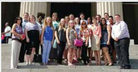
SADD Teen Leaders on The Hill in Washington DC.

The NRSF again sponsored SADD SPEAKS (Students for Policy, Education, Advocacy and Knowledge), an innovative effort to equip, train and empower teen leaders in traffic safety advocacy. Fourteen