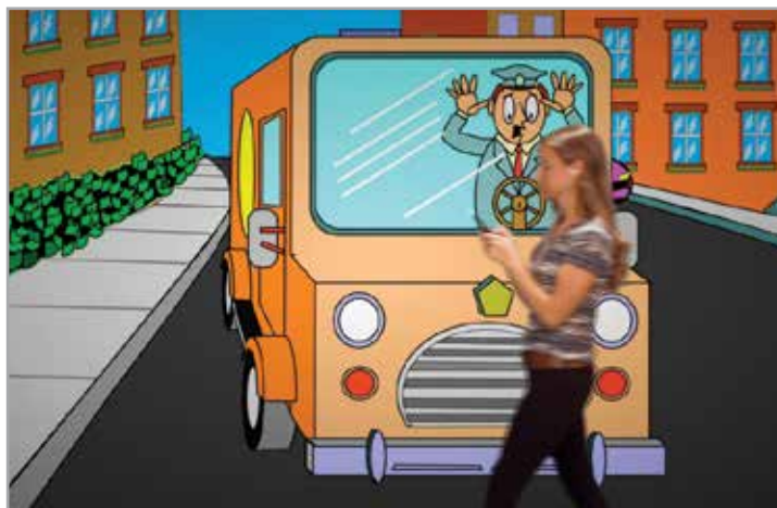
A frame from last year's winning PSA