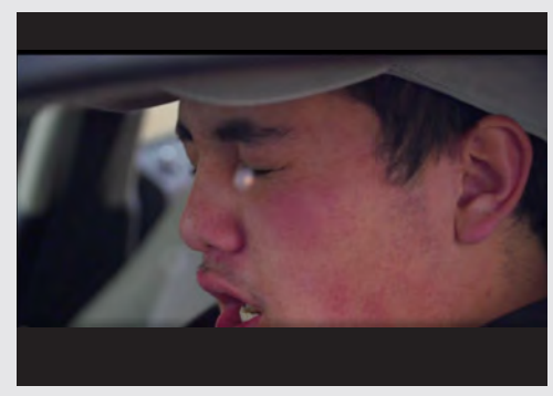
A still from "The Cost of Speeding:

The FCCLA Chapter at Peachtree Ridge High School in Suwanee, GA won the $1,000 second prize and the chapter at Spring Lake Park High School in Spring