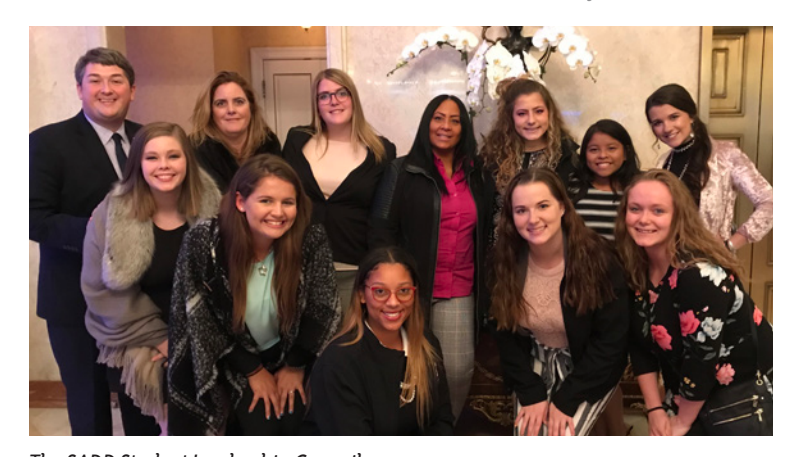
The SADD Student Leadership Council

The NRSF again hosted the leaders of two youth advocacy organizations we support and work closely with on traffic safety programs.