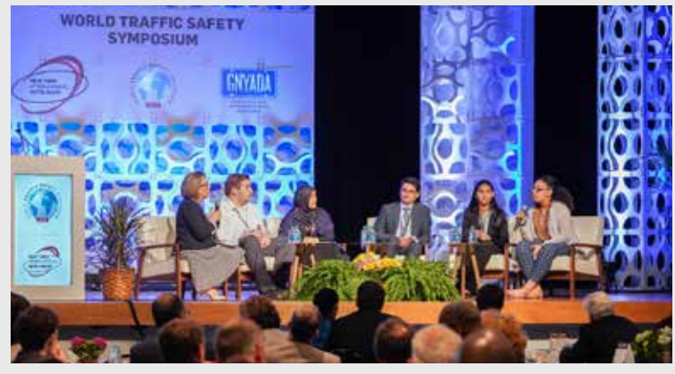
Young people gave examples of how to reach their peers at the NY Auto Show's World Traffic Symposium