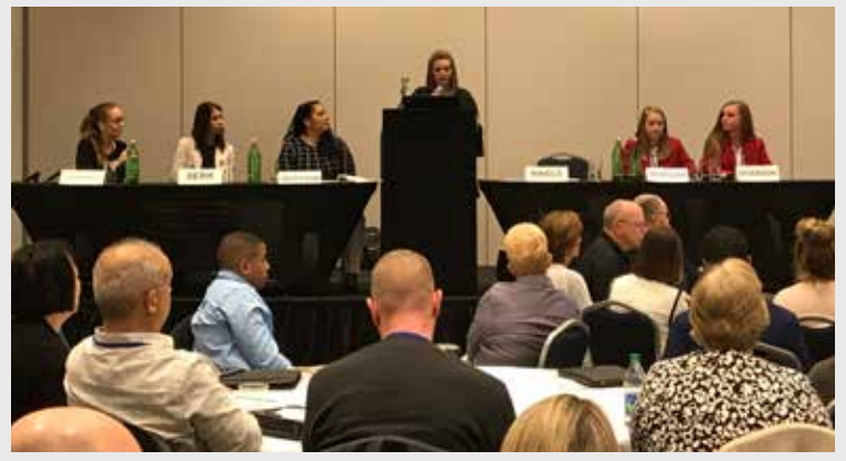
The panel on youth engagement drew a standing room only crowd at Lifesavers.

Engaging young people in traffic safety initiatives was in the spotlight at two industry events this spring.