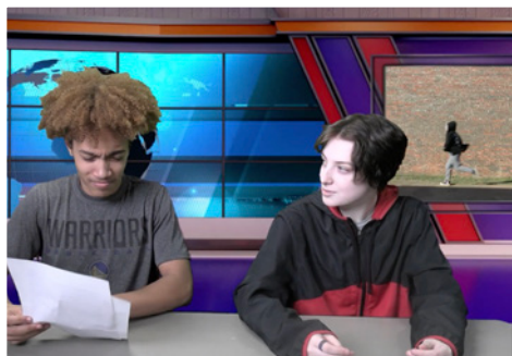
Stills from “Be a Leader, Not a Speeder”